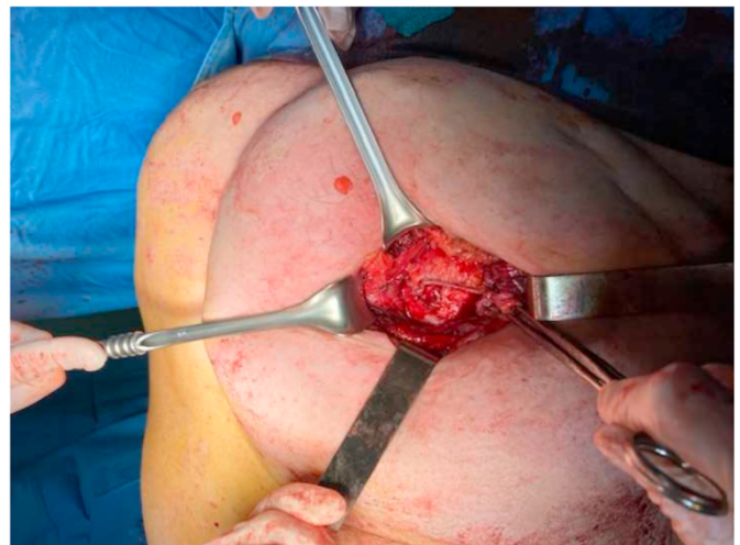
Fig. 2. The posterior fascial plan is completely closed by linear stapler suture.

The first to publish findings on the use of prosthetic reinforcement for PSH repair were Hopkins and Trento [13]. They suggested that