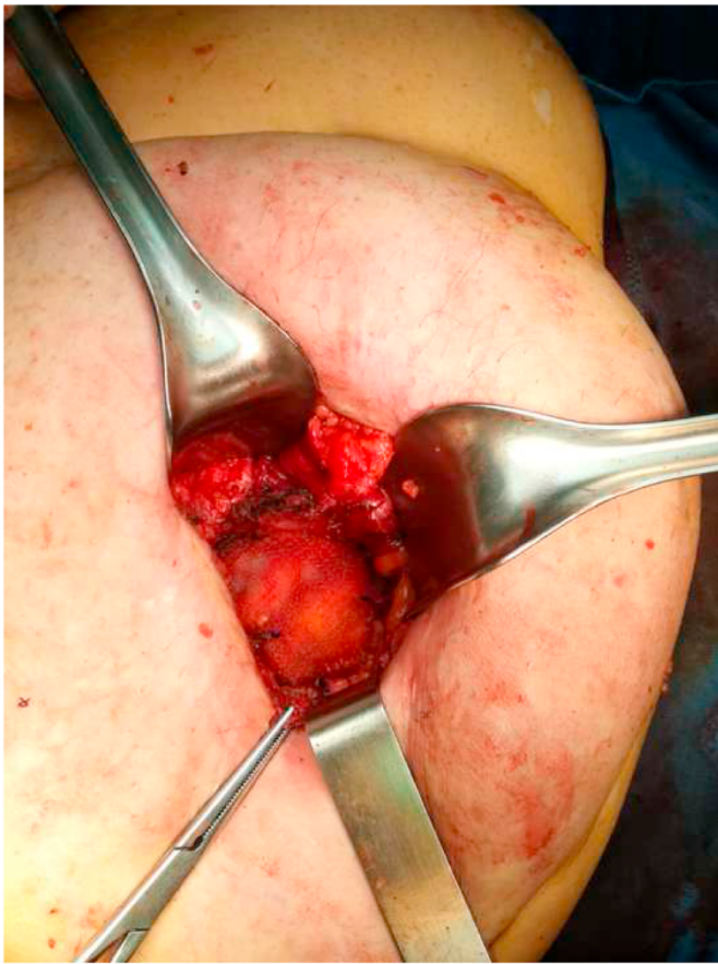
Fig. 3. A resorbable mesh with a resorbable hydrogel coating was placed in sub-layer space.

patient with recurrent hernia formation, following multiple abdominal procedures, was the ideal candidate for the use of a mesh [13]. At first, the idea of absorbable materials in contact with organs and the placement of an implant in the contaminated stoma environment led to the conclusion that the use of mesh for the repair of PSH was not advisable. Afterwards, with the development of biomaterials, which are better integrated and cause a lower inflammatory response, the technique gradually became the gold standard in correcting parastomal hernia [14]. Actually, the most representative procedure for surgical repair is the Sugarbaker technique which consist on the preparation of the hernial sac after laparotomy, lateralization of the colon, and placement of a prosthetic mesh in intraperitoneal onlay position (IPOM) [15]. The repair of hernia depends quite completely on the presence of an