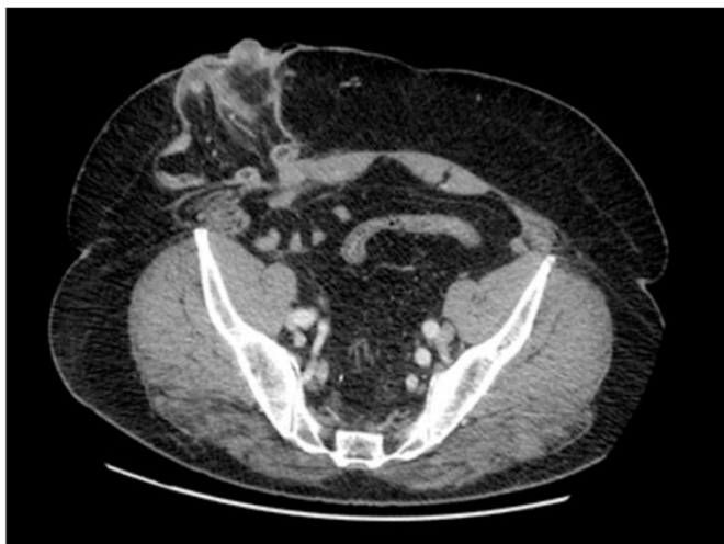
Fig. 1. Pre-operative ct-scan for the study of the parastomal hernia.

The defect's lateral and medial margins are then transposed towards each other and kept side by side with a gripper; a 60 mm tristaple linear stapler was placed, incorporating both edges and the charge is fired to