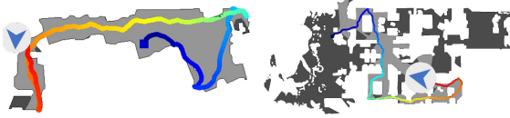
Fig. 3. Qualitative results of the agents' trajectories in sample exploration episodes.

The policy and the dynamics models are trained using PPO [34]. The parameters in Eq. 3 are set to \lambda = 0.1 and \beta = 0.9 . The penalty introduced in Eq. 2 is triggered if the agent repeats the same action for \tilde{t} = 5 and assumes a value p_t = \tilde{p} = 0.01 .