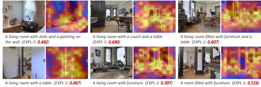
Fig. 4. Qualitative captioning and explainability results. For each image, we report the generated caption, the saliency map produced by CAAM, and the EXPL-S score.

caption and regions attended by the visual encoders. This can also be observed in Fig. 4, where we show qualitative results on Matterport3D environments. For each sample, we report the RGB view of the agent, the generated caption, and the saliency map produced by CAAM, which is the basis for the computation of the EXPL-S score. As it can be noticed, the EXPL-S score quantifies the degree of alignment between the generated caption and the saliency map.