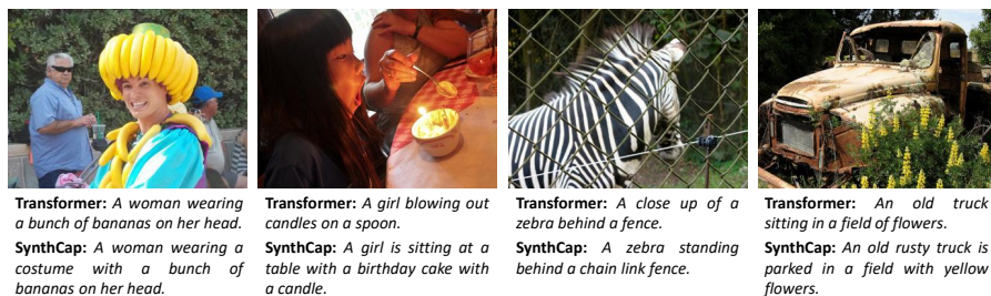
Fig. 2. Qualitative comparison between SynthCap and the baseline on sample images from the COCO dataset.

seeds. Also in this setting, SynthCap achieves the best results according to all evaluation metrics. Finally, in Fig. 2, we show some qualitative results on sample images from the COCO dataset, comparing captions generated by our model with those generated by the baseline without synthetic data augmentation.