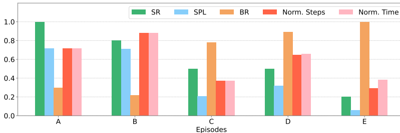
Fig. 3. Comparison of the main navigation metrics on different episodes.

the most challenging scenario for our LoCoNav is when reaching the goal requires to get out of a room and then enter a door immediately after, on the same side of the corridor (as in E). Since the robot sticks to the shortest path, the low parallax prevents it from identifying the second door correctly. Even in these cases, a bit of general exploration helps to solve the problem.