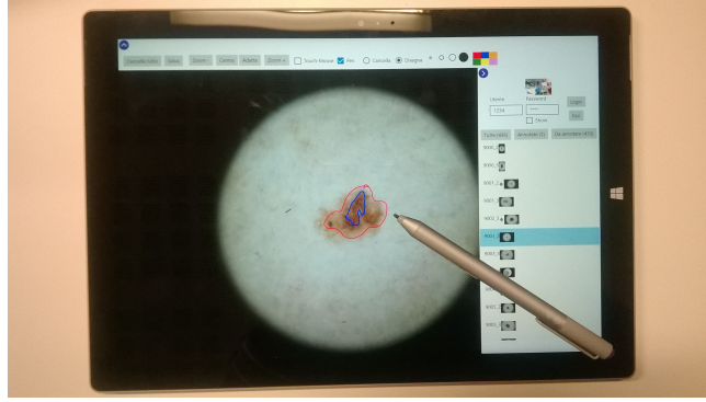
Fig. 1. The original annotation tool developed for Microsoft Surface Pro 3

The aim of this work is to apply the gamification process to one of the main activity in the daily work of dermatologists with which they make diagnoses and comparisons: the medical image annotation. The paper is organized as follows: Section 2 describes the general architecture and the design assumptions taken for the videogame while Section 3 shows technical details for the development of the prototype; finally conclusions and future work are illustrated in Section 4.