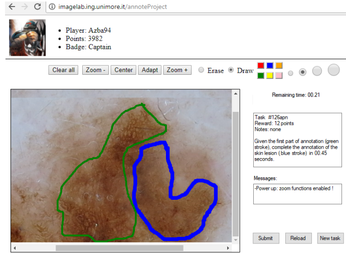
Fig. 3. The user interface of the Annote serious game

and widgets, instantiate the timer, load the image or draw default strokes). To manage game dynamics like power-up or the increasing difficulty , the game client implements a simple event manager that sends asynchronous messages to the server which in turn raises appropriate counter-events: for example, the end of the time involves a game failure, a zoom event will enable/disable the corresponding buttons, a time X event will increase/decrease the timer by X seconds, a speed X event will increase/decrease the mouse/pen speed by an amount of X. When a student commits his work, the server algorithms will compute the corresponding rewards and will update the total points of the player in the leaderboard rank of the registered gamers.