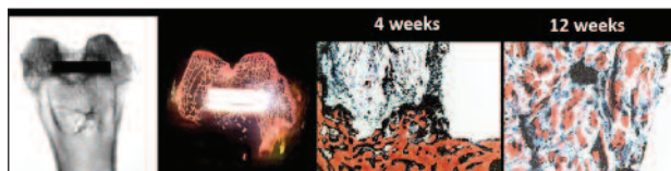
Figure 2. Trabeculae oriented orthogonally to the magnetic field lines.

inserts embedding magnetite NPs in different percentages (wt. % 95/5, 90/10, 50/50 and 100/0, w/w) were fabricated using a foaming technique and sintered at high temperature in a controlled atmosphere (30). As expected, only HA and magnetite phase were revealed at the XRD results; hematite was detected as secondary phase when magnetite content was higher than 10%. In vitro tests using human osteoblast-like cells were carried out with or without the application of an external magnetic field (320 mT). The whole external surface of the scaffold was completely covered by cells 7 days after seeding, while at 14 days, they filled a good part of the inner micro-pores. Cell proliferation was higher for the 90/10 compound both at 7 and 14 days from seeding, irrespectively of the presence of the external magnetic field.