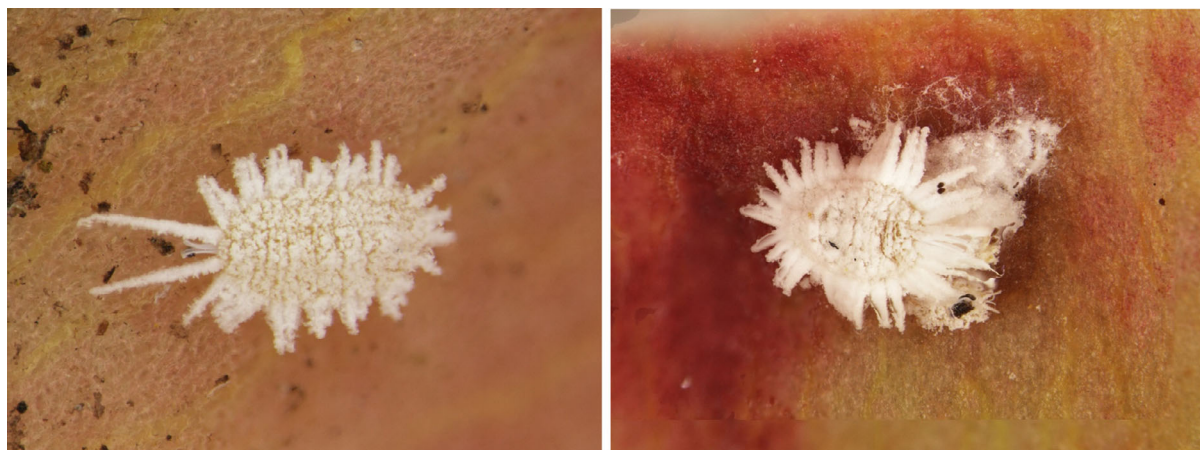
Figure 1: Pseudococcus cryptus , nymph (left) and adult female with ovisac (right)

Important features of the life-history strategy of P. cryptus are summarised in Table 2.