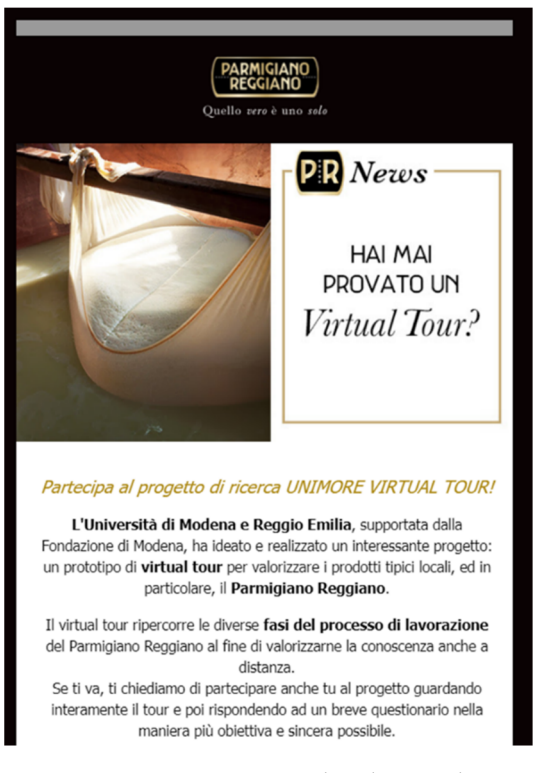
Figure 3. Communication used in the newsletter to launch the VT.