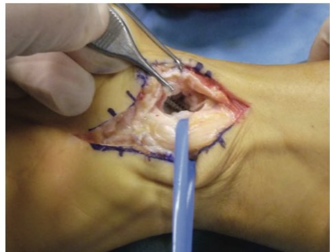
Fig. 2. Screw removal.

Within scaphoid fractures, the median nerve can be damaged in some ways. A displaced fracture could determine an acute 4 or progressive nerve compression, 5,6,7