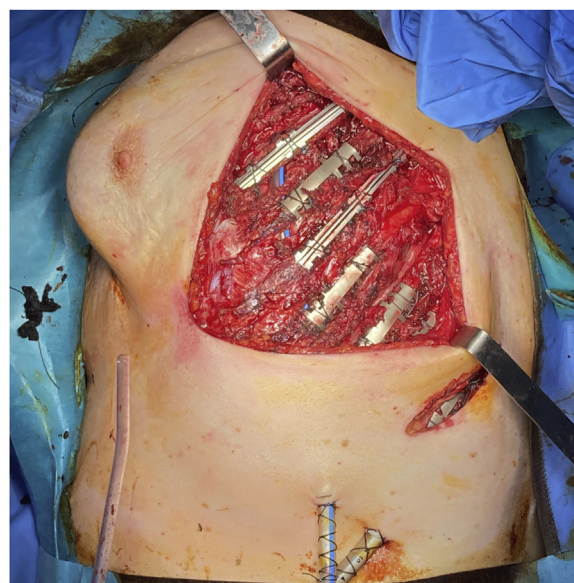
Fig. 2. Intra-operative pictures at the end of the fixation, showing the metallic plates in place: two SLP on the second and fourth rib and six JP on the third, fifth, sixth, seventh and eighth rib. The sutures around the plates are also visible, two for each plate.

Postoperative chest-x-ray showed the correct positioning of the plates (Fig. 3). Mechanical ventilation was continued for three days and then weaning was started. The weaning was completed in two weeks and the patient was supported through non-invasive ventilation for seven days more. No paradoxical movement of the left chest wall was observed during spontaneous respiration and the chest wall adequately expanded. The patient left the ICU 49 days after the admission and was sent to an inpatient rehabilitation facility. A respiratory support with a high-flow nasal cannula was initially necessary, then the support was shifted to conventional oxygen therapy, similar to that previously required by the patient. Unfortunately, an unexpected bilateral pneumonia developed during recovery, with a rapid deterioration of the respiratory function. The patient was readmitted to the ICU and died 6 days after, that is 3 months after the trauma.