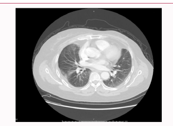
Figure 2: Case 2: Interstitial infiltrates in the pulmonary lower left lobe found on routine CT scan in asymptomatic patient.