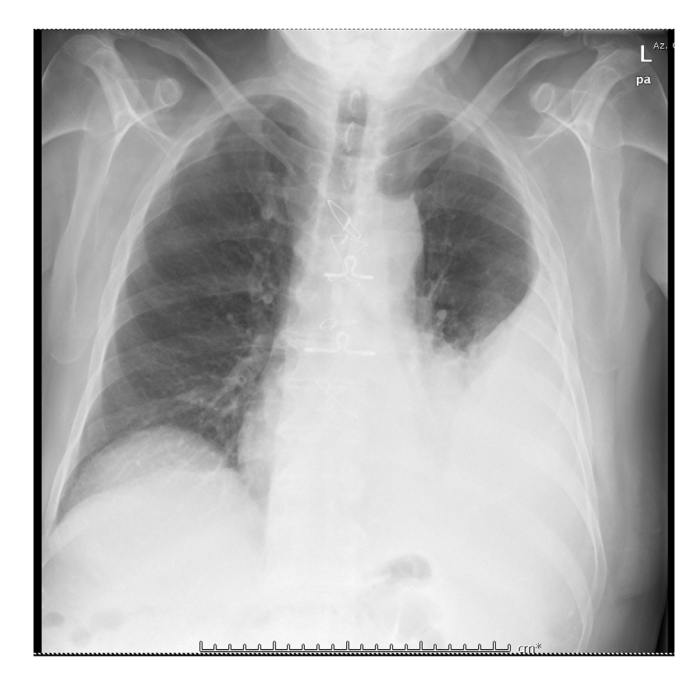
Fig. 2. Chest radiograph after pleural effusion relapse with no evidence of chylothorax at physical and chemical examination.