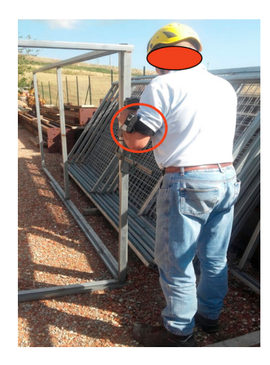
Figure 2. A construction worker in Tuscany wearing the GENESIS-UV dosimeter on the upper left arm.

2.4. Estimates of Ambient Solar UVR Exposure at the Workplace and Reconstruction of the Cumulative Annual UVR Exposure of the Workers