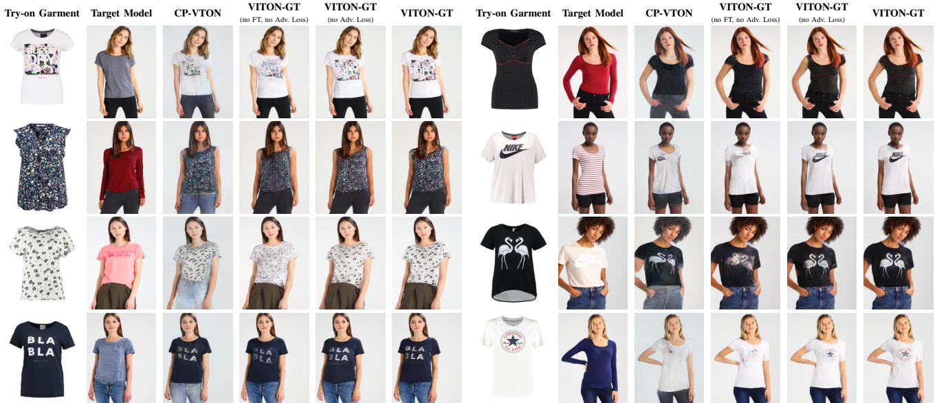
Fig. 4: Qualitative results on VITON test set [7]. We report the results generated by our complete model, our model without adversarial training, our model without finetuning and adversarial training, and CP-VTON [8].