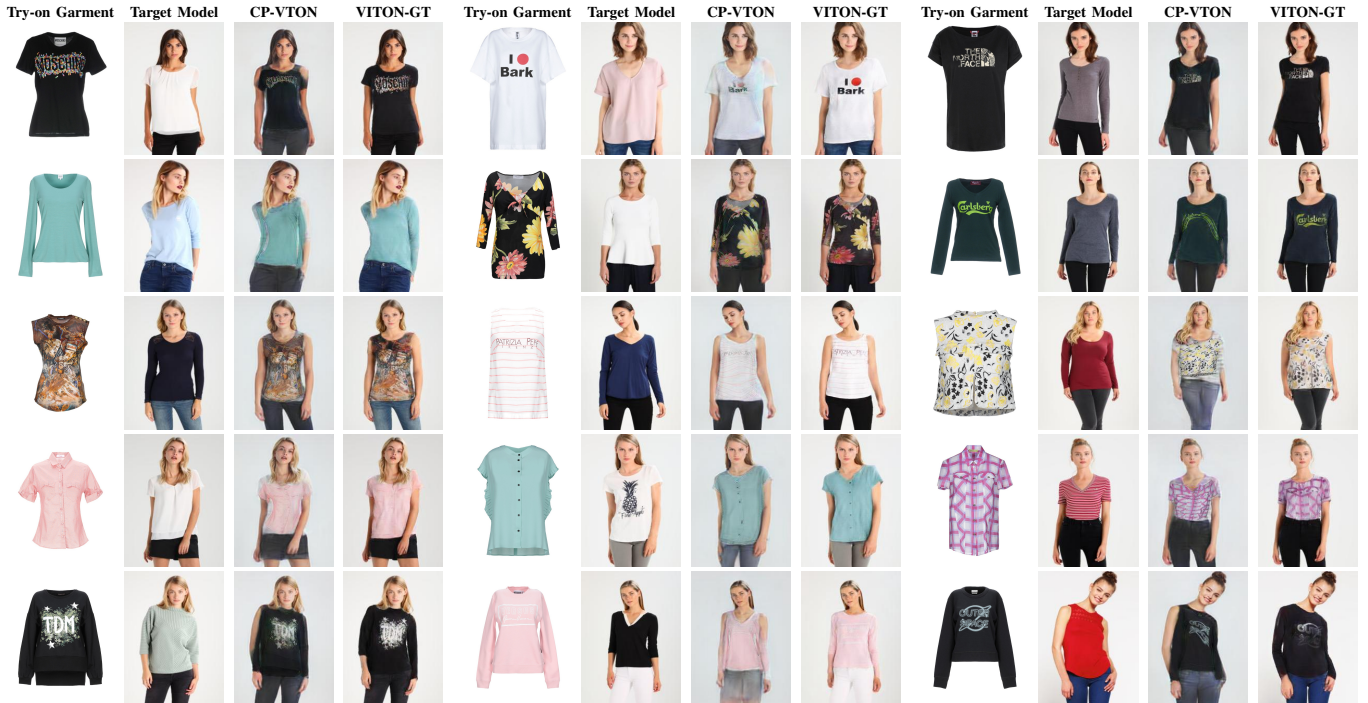
Fig. 6: Qualitative results on different categories of out-of-domain upper-body clothes. For each category, we report three sample try-on images generated by our model in comparison with those generated by CP-VTON [8].

for the try-on generation task. We compare our complete model with CP-VTON. As an ablative analysis, we progressively remove the finetuning of the geometric transformation module, and the contribution given by adversarial training. In particular, we show the results by training the two modules of our model separately and by removing the adversarial loss ( i.e. VITON-GT (no FT, no Adv. Loss)) and without adversarial loss only ( i.e. VITON-GT (no Adv. Loss)). While SSIM and MS-SSIM scores are computed on the paired test set, all other metrics are evaluated on the unpaired setting. As it can be seen, all versions of our model achieve better results than CP-VTON according to all evaluation metrics. In particular, the superior performance of VITON-GT (no FT, no Adv. Loss) compared to CP-VTON further demonstrates the effectiveness of our two-stage geometric transformation module that can help to improve the results of the entire pipeline. Moreover, both finetuning and adversarial training give a significant contribution to the final results.