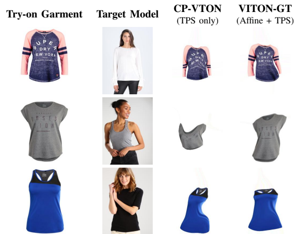
Fig. 3: Warping qualitative results on VITON test set [7].

than FID and KID metrics [36], it is widely used to evaluate the image quality of virtual try-on architectures [16], [9].