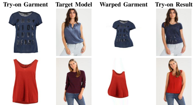
Fig. 1: Given an in-shop garment and a front-view target model, virtual try-on architectures generate a new image where the input garment is virtually worn while preserving the body pose and identity of the target model. The proposed architecture, VITON-GT, can generate high-quality images thanks to multiple geometric transformations.

In spite of its intrinsic complexity, virtual try-on is an important challenge and a priority for e-commerce companies. Indeed, it could help the users decision on what to buy and potentially reduce the returns of clothes already purchased. It could also make the supply chain more efficient and less expensive, limiting the number of fashion models required