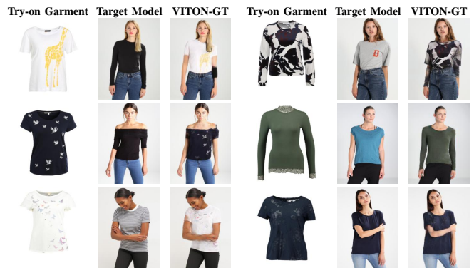
Fig. 5: Failure cases on VITON test set.

Warping results. To validate the effectiveness of our two-stage geometric transformation module, we evaluate the visual quality of the generated warped clothes. Table I reports the