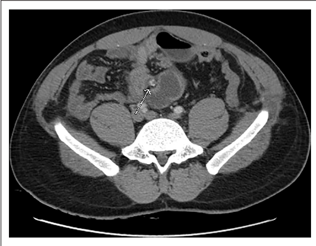
Figure 1. Calcification in the mesenteric root at CT scan.