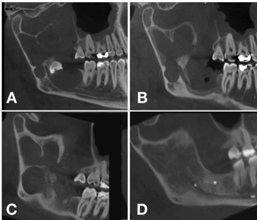
Fig. 1. Radiographic images of the multilocular odontogenic keratocyst (OKC): A) CBCT scan at the radiographic diagnosis: the lesion appears as multilocular, includes part of the impacted third molar and involves the IAN; B) CBCT scan 8 months after marsupialization (first surgical approach) with signs of bone deposition and progressive reduction in lesion volume; C) Radiographic control (CBCT) 20 months after marsupialization showing as the lobe of the OKC located on the posterior border of the mandible was increasing instead of diminishing; D) CBCT scan taken 12 months from the second surgical treatment (radical excision) with a good bone healing and incorporation of the osteosynthesis plate. CBCT= Cone Beam Computed Tomography, IAN = Inferior Alveolar Nerve, OKC = Odontogenic Keratocyst.

Consequently, a second surgery was scheduled to remove the cysts. The pre-surgical study of the CBCT highlighted that the routine approach to the cyst, lateral osteotomy, would cause difficulties in cyst removal, with reduced view of the surgical field, an increased risk of IAN injury, and the sacrifice of a large amount of bone. Furthermore, because of weakening of the mandible structure, a risk of post-operative mandible fracture was present. In this situation, the idea of approaching the problem with sagittal osteotomy arose. This surgical procedure, normally performed in orthognathic surgery, consists of opening the two mandible portions, allowing the surgeon