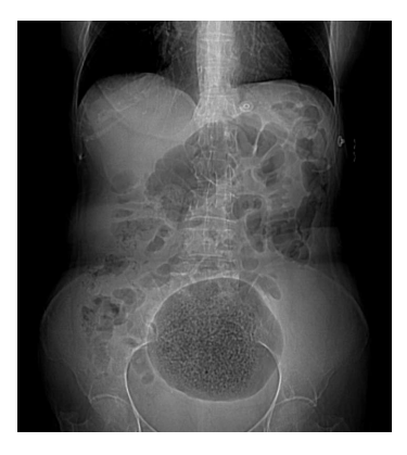
Figure 1 Abdominal X-ray shows a large gas-filled cavity in the lower abdomen.

considered in patients refusing surgery and in high-risk patients to resolve acute inflammation and are typically followed by a delayed elective segmental colectomy.