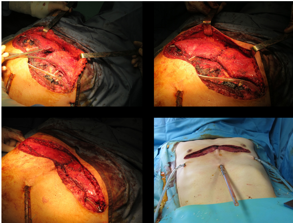
Fig. 2. Pectoralis muscle transposition and medial suturing.