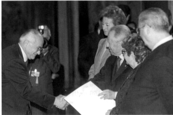
Photo of the Awards Ceremony