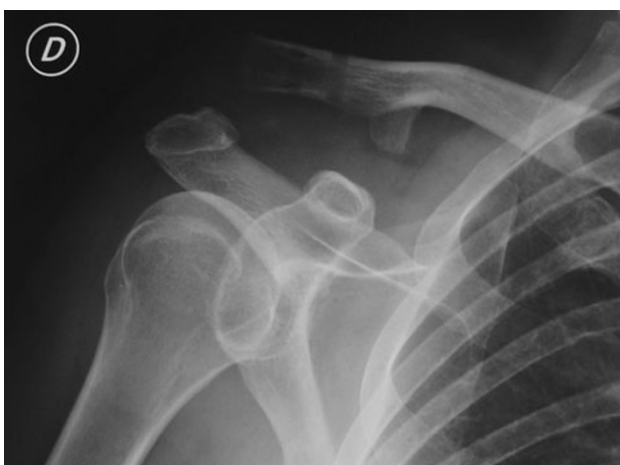
Fig. 5 Postoperative X-rays: complete dislocation after stabilization with the biological graft. Note the coracoclavicular ossification

From 1861 [14] to the present, 60 different surgical procedures have been devised to treat acute and chronic AC joint dislocation, but finding the gold standard has proved an elusive task. In 1972, Weaver–Dunn [15] proposed the transposition of the coracoacromial ligament to the lateral portion of the clavicle. This approach involves sacrificing the coracoacromial ligament (a humeral stabilizer). The interest in this type of technique, which is based on the assumption that AC joint reduction and anatomical restoration provide more satisfactory outcomes [16], has recently been revived by the introduction of synthetic ligaments [17, 18] and biological grafts [16, 19]. Techniques based on the transposition of the patient’s tendons that show resistance to cyclic loading, similar to rigid osteosynthesis (screws, plates, pins, metal or synthetic cerclage) [20, 21] but with lower rates of intra- and postoperative complications, were developed to address these problems