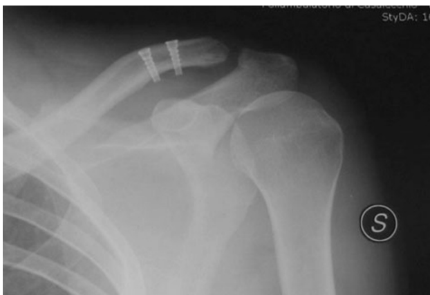
Fig. 7 Postoperative X-rays: left AC joint stabilized with the synthetic ligament (LARS LAC®)

Eleven out of 40 patients were previously surgically treated using different surgical techniques, which affected the articular biomechanics of the AC joint in different ways, and consequently influenced the homogeneity of the study