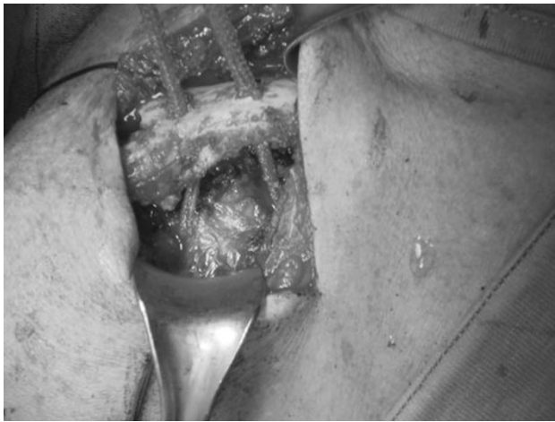
Fig. 3 Intraoperative image showing the synthetic ligament (LARS LAC®, Arc sur Tille, France) as it is being passed under the coracoid and through the clavicular holes

40 patients had to change their habits after the operation due to the clinical outcome, including returning to sports or a job.