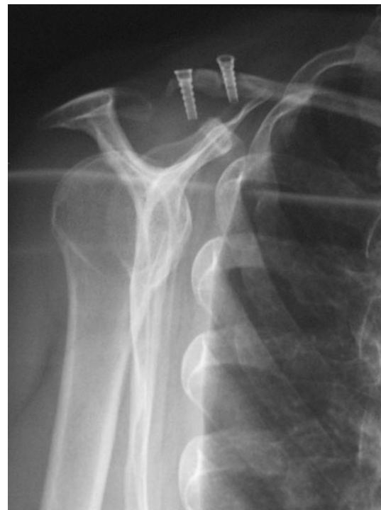
Fig. 8 Distal clavicular fracture, osteolysis and screw loosening in a patient treated with the synthetic ligament (LARS LAC®)

population. In these patients, we found a higher incidence of periarticular ossifications, clavicular osteolysis, and fibrous adhesions intraoperatively, which made it more difficult to expose the clavicle and acromion. Furthermore, the passage of the graft under the coracoid required a longer surgical step due to the thickening of the surrounding soft tissues. Despite these difficulties, we did not find any significant effects on the clinical scores and AC joint stability based on the X-rays for this subgroup of patients.