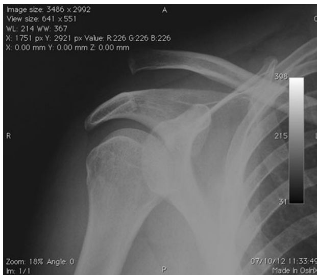
Fig. 1 Complete AC joint dislocation, right shoulder (type IV of Rockwood et al. [4])