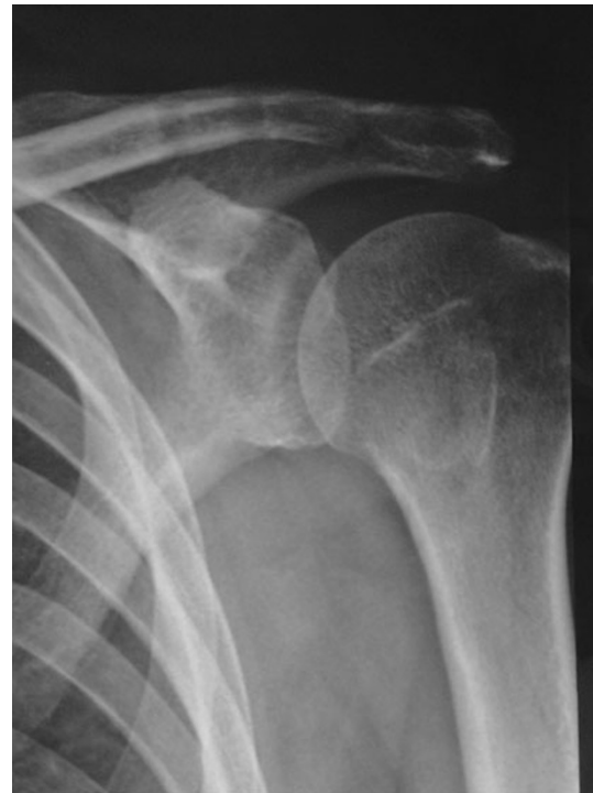
Fig. 6 Clavicular osteolysis around the screws in a stable AC joint treated with the biological graft

[8, 19, 22–24]. Bailey [25] was the first to report the results of tendon transposition; Dewar and Barrington [26] used only coracoid transposition and obtained better mid-term outcomes compared with the Weaver–Dunn procedure in young patients [27]. Although transposition of the coracoid with the conjoint tendon reinforces the reconstructed coracoacromial ligament, it involves a greater risk of coracoid fracture and musculocutaneous nerve injury; furthermore, bone cerclage may result in coracoid or clavicle osteolysis.