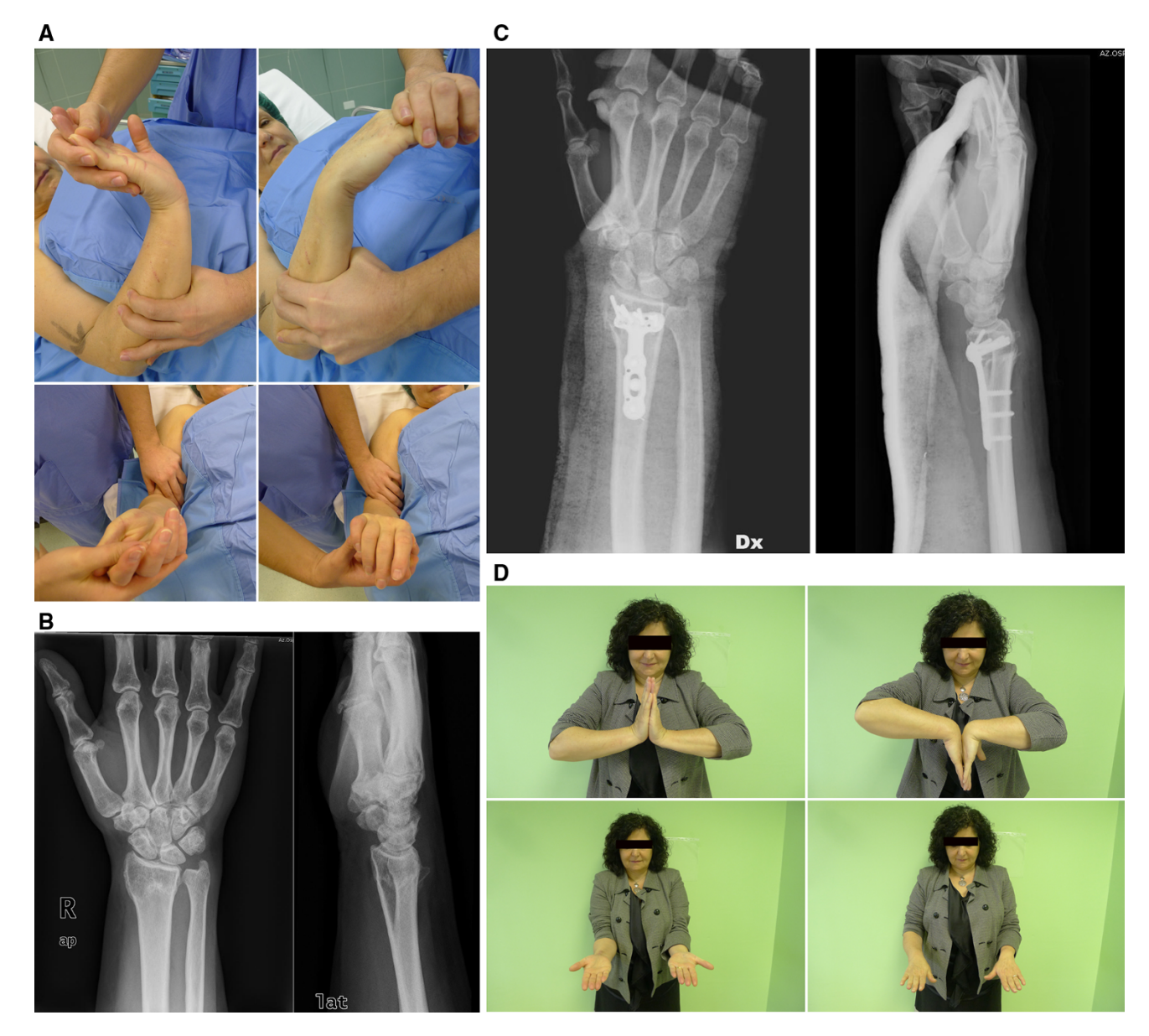
Fig. 2 Case 2. a Range of motion evaluation before surgery with significant reduction of flexion. b Preoperative X-rays showing the dorsal inclination of articular surface of the distal radius.