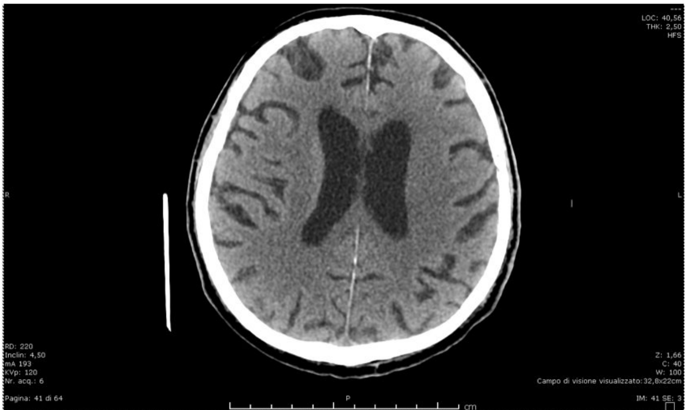
Figure 2. Head CT scan of the patient. There is a mild dilatation of the ventricular system without others

On the third day of admission the patient began lethargic with a Glasgow come score < 8. A head CT scan showed a slightly enlarged ventricular system without evidence of ischemic or hemorrhagic stroke, space-occupying lesions or asymmetry (Figure 2).