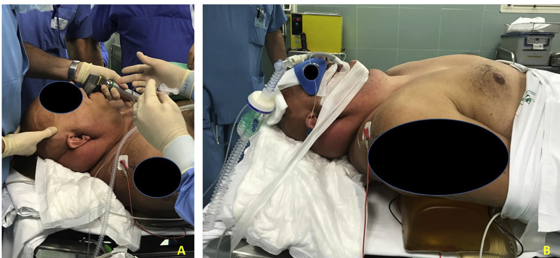
Fig. 3. shows the patient positioning before surgery and the anesthesiologist management during intubation.

After careful positioning ( Fig. 3A and B ), the patient underwent total thyroidectomy by anterior cervicotomy. Total thyroidectomy was performed with technical difficulties: first, intubation of the patient was required for the operation due to the hyperextension of the neck; second, access to the goiter was difficult due to the amount of adipose tissue, as well as the buffalo hump and taurine neck. Thyroid isolation was complicated on the right side of the gland for the increased volume, particularly due to difficulty in recurring laryngeal nerve isolation. No intraoperative complications and no bleeding loss were observed during or after surgery. The drains were removed on the second postoperative day. Despite the patient's HIV infection, no complications were noted after surgery, especially around the wound. Calcium blood values stayed in the normal range after surgery. The patient presented