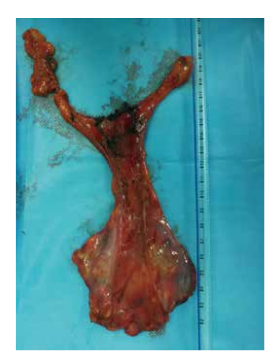
Figure 5 Thymoma and thymus tissue.

measured using the SF-12 questionnaire (8). Pain and quality of life were reported as average scores \pm standard deviations.