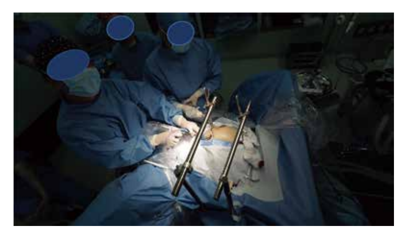
Figure 2 Intraoperative view during subxiphoid thymectomy.