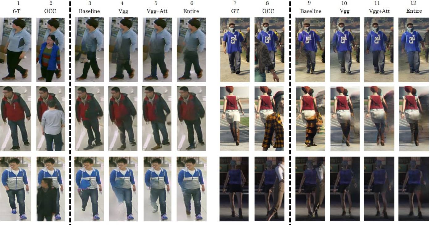
Fig. 3. Qualitative results based on the ablation study on RAP dataset (leftmost) and AiC dataset (rightmost). GT columns indicate ground truth images while in the OCC columns are presented the input occluded images. Columns 3 and 9 are the outputs of our baseline, where adversarial loss and MSE are used. Columns 4 and 10 represents results of the VGG loss. On 5 and 11 we have results of experiments using all the 3 losses combined: adversarial loss, VGG loss and attribute loss. Finally, columns 6 and 12 show results where attributes are injected as input to the network.

L1 or L2, that evaluate the per-pixel distance between the generated and the ground truth image. Usually, training a network using such losses leads to reasonable solutions. However, the outputs appear blurred with lack of high frequency details.