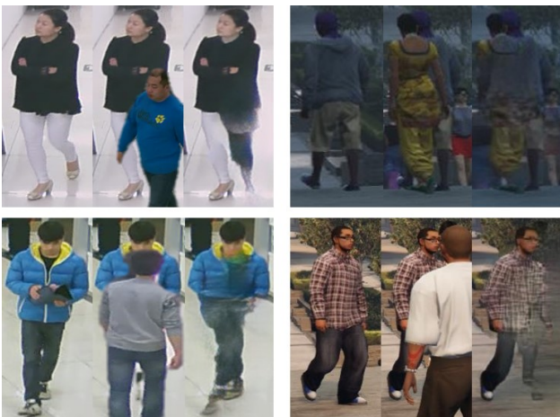
Fig. 6. Some failure cases on RAP (leftmost) and AiC (rightmost). From this images, it is possible to see that, in cases of strong occlusions, complete restoration remains a difficult task. Moreover, also with particular background conditions, as we can see in the first image triplet, the network is not able to perform a reliable reconstruction.

From Fig. 5 it emerges that our method, despite not using attention mechanisms, is able to detect and to remove the occlusion, with no external additional information. Furthermore, differently from Fabbri et al. (2017) and Isola et al. (2017), our method learns to transfer with no alterations the portion of images that are not occluded. Finally, Fig. 6 depicts some failure cases of our method that display the challenge of strong occlusions.