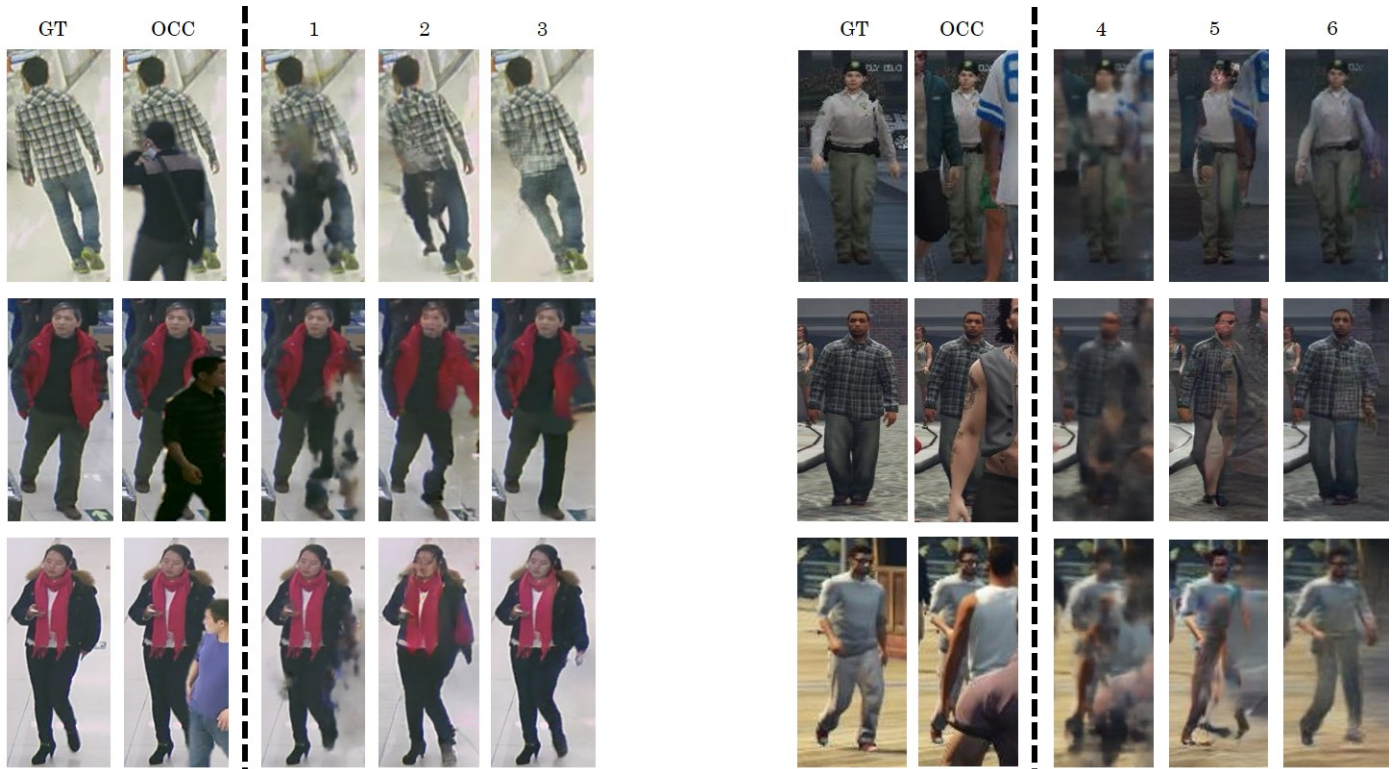
Fig. 5. Qualitative comparison with state-of-the-art approaches: results are presented for both RAP (leftmost) and AiC (rightmost). GT columns indicate ground truth images while in the OCC columns are presented the input occluded images. Columns 1 and 4 are the images recovered by Pix2Pix in Isola et al. (2017). On 2 and 5 are presented results obtained from the method used in Fabbri et al. (2017). The last two columns, 3 and 6, show our best approach output.