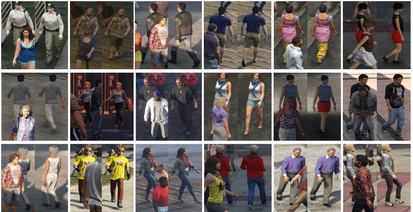
Fig. 4. Examples from the AiC dataset exhibiting its variety in viewpoints, illuminations and scenarios.