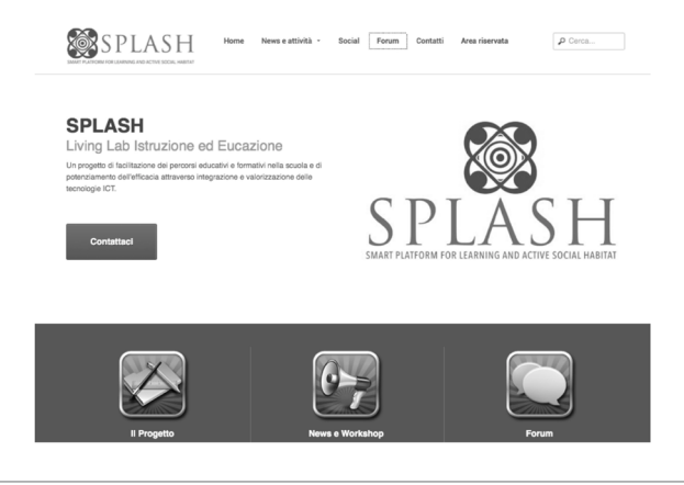
Fig. 1 Splash platform: homepage

Selected best practices of social learning environments for schools were also explored. Among the examples: Scholar platform, Oilproject, Fidenia, the Google app called Classroom. The platform Eduthinktag, adopted in the previous school year by the school "Marco Polo", was a further design example. During the first meetings some needs were expressed by teachers: