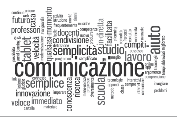
Fig. 3 School and technologies: students' tag cloud

During the first focus group session the students chose three keywords describing their idea of "school and technology". The tag cloud below summarizes the words most frequently used.