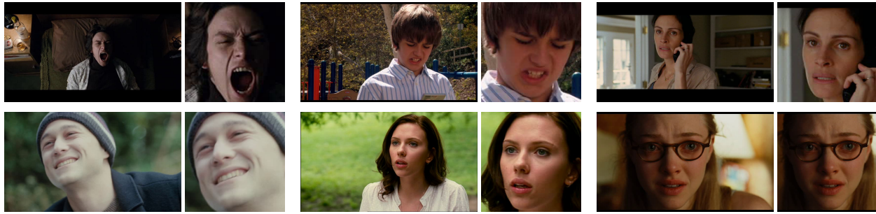
Figure 2: Some examples of cropped faces extracted from input video frames.

The CNN-RNN, C3D and audio SVM model were trained separately and their prediction scores were combined into the final score. Kaya et al. [25] combine audio-visual data with least squares regression based classifiers and weighted late fusion scheme. Recent work investigate the use of DNN to fuse multimodal information. One advantage of DNNs is their capability to jointly learn feature representations and appropriate classifiers [27]. Some fusion methods based on fully connected layers have been suggested to improve video classification by capturing the mutual correlation among different modalities. For example, in [47], a fusion network is trained to obtain a joint audio-visual feature representation.