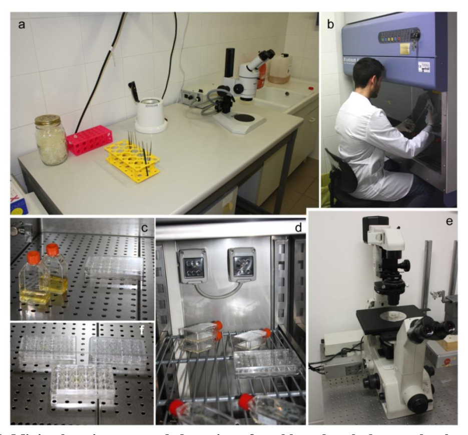
Figure 1. Minimal equipment needed consists of a table or bench that can be cleaned with ethanol solutions for the performance of dissections at the stereomicroscope (a), a laminar flow hood (or biological safety cabinet) to manage cells and sterile reagents (b), a refrigerated incubator to maintain cell flasks/dishes at 24-28°C (c, d) and an inverted phase contrast microscope to observe cells (with a 10X or 20X, and 40X phase contrast objectives) (e).

species, even though it was originally formulated for Lepidoptera (Grace, 1962). Schneider's Drosophila medium originally developed for Drosophila cell culture, but it can be also used for other dipteran cell lines. EX-CELL 420 medium has been used for different Diptera and Lepidoptera and more recently for the red beetle, Tribolium castaneum (Goodman et al., 2012). Good results for Coleoptera have also been reported with the Schneider's medium (supplemented with 15% fetal bovine serum) and the Kimura's medium (Kimura, 1984) suggesting that Coleopteran cells can also be maintained and cultured in different media (Zhang et al., 2014).