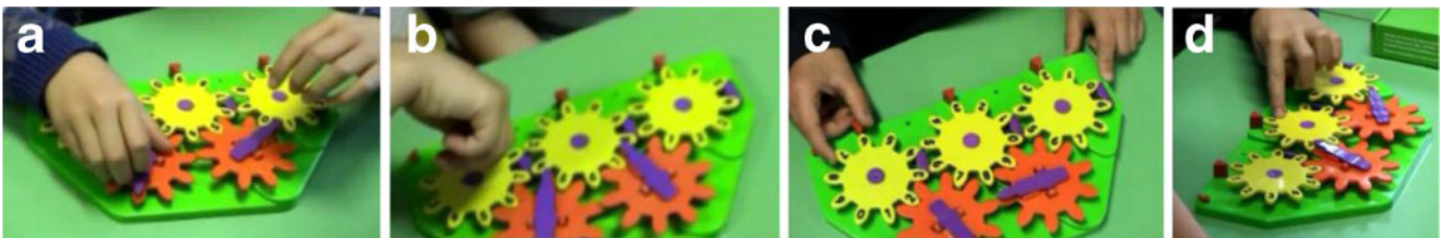
Figure 2. Usage and deictic gestures (Exp_A)

The students also found that the movement of the wheel is not continuous but jerky and the movements of the wheels were linked together. In general, other static artefact components (as the red triangles and the point) were detected later, as well as the sound.