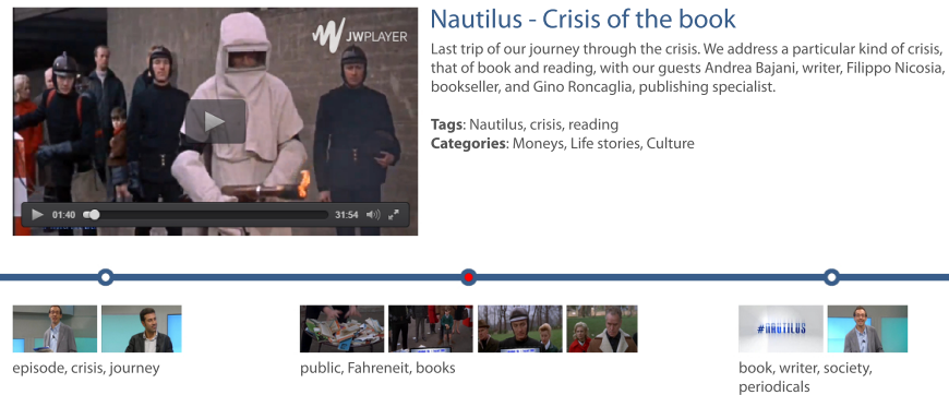
Fig. 4. Effective video browsing using our algorithm. Users can visualize a summary of the content by means of the extracted scenes.