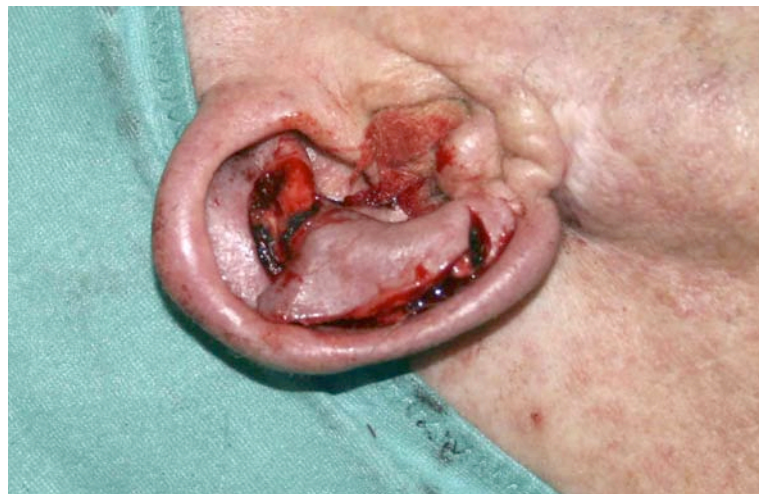
Fig. (5). Harvested PAAP flap.

2003 Dr. Ladocsi introduced the concept of a chondro-cutaneous rotation flap supplied by perforating branches of