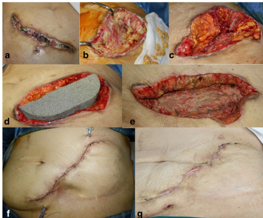
Figure 2 Phases of surgical treatment. Patient presenting with a dehiscent abdominal wound colonized by Acinetobacter baumannii after kidney transplant (a). Serial wound debridements (b, c). Negative pressure dressing (V.A.C. GranuFoam Silver®) positioned (d). Clinically satisfactory appearance, with healthy granulating tissue despite still positive microbiological cultures (e). Primary closure, 2 days post-operatively (f), and 2 weeks post-operatively (g).

The two series of patients were not different in terms of sex, age, etiology of immunodeficiency, size of the