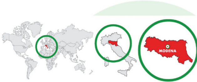
Modena is at the heart of Emilia-Romagna, the land with the most friendly people Fig. 4 – The Agency’s geographical location