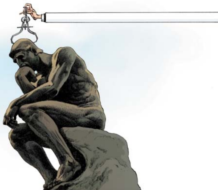
Illustration by David Parkins

Data are increasingly used to govern science. Research evaluations that were once bespoke and performed by peers are now routine and reliant on metrics 1 . The problem is that evaluation is now led by the data rather than by judgement. Metrics have proliferated: usually well intentioned, not always well informed, often ill applied. We risk damaging the system with the very tools designed to improve it, as evaluation is increasingly implemented by organizations without knowledge of, or advice on, good practice and interpretation.