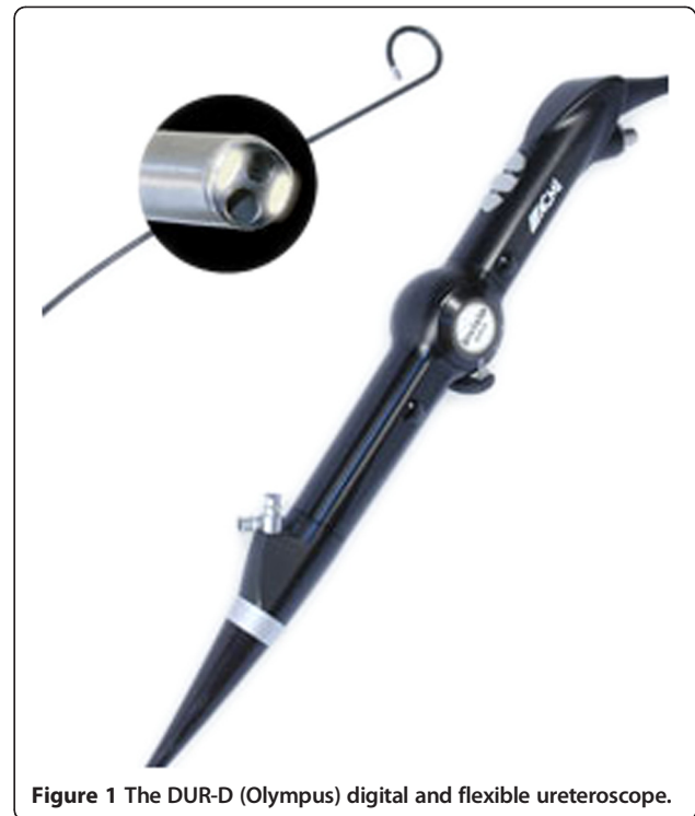
Figure 1 The DUR-D (Olympus) digital and flexible ureteroscope.

Deflection capability is also an important issue. The Storz FlexX2 Wolf Viper allows a 270° deflection in both directions, while the Olympus P5 allows 270° in one direction and 180° in the other. The DUR 8-elite ureteroscope (ACMI) was the first to offer dual primary and secondary active tip deflection that totals 270°. Preliminary reports suggest that secondary deflection is necessary in approximately 20–29% of cases [102-104], particularly with regard to lower pole access. Although expensive, the holmium: YAG laser is actually the best