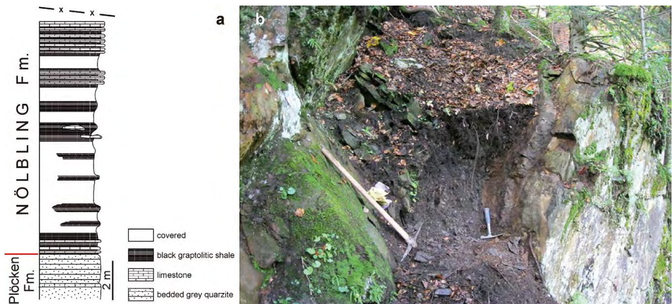
The Nöblinggraben Section. a) lithostratigraphic column of the section (redrawn from JAEGER & SCHÖNLAUB, 1977); b) close view of the Nöbling Formation exposed in the Nöblinggraben Section.