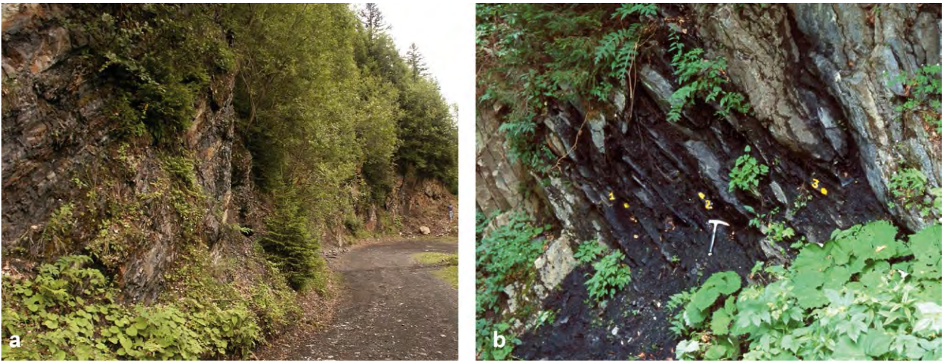
Views of the Nölbling Formation in the field: a) global view of the Nölbling Formation exposed in the Oberbuchach I Section; b) detail of the unit exposed at the Rio Malinfier West Section.