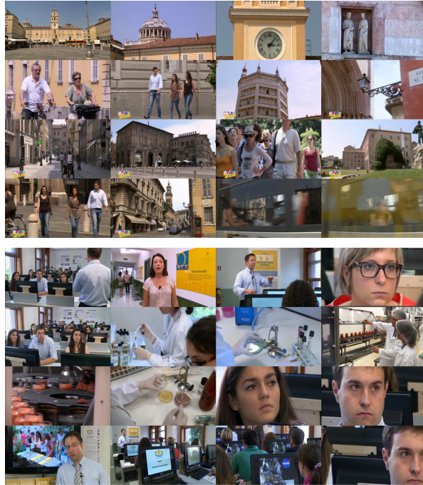
Fig. 2. Two consecutive scenes from the RAI dataset.