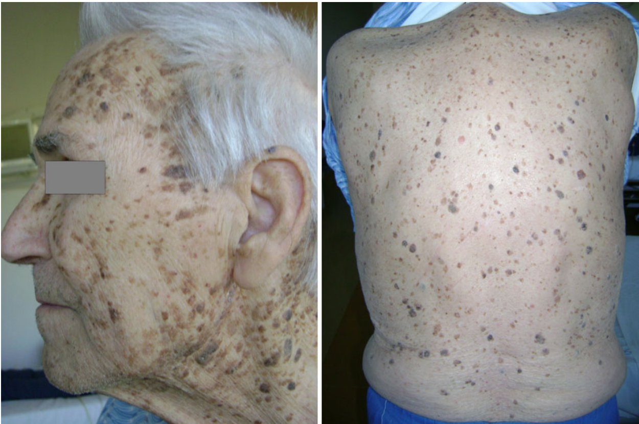
Figure 1 Clinical presentation of innumerable seborrheic keratoses concentrated over the face, neck, back, and chest.