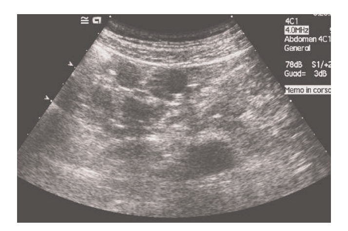
Figure 2. Second-look ultrasound of the nodule in figure 1. US shows homogeneous splenic-like echogenicity of the nodule in the paracolic space, thus confirming its splenic origin.

presence of peritoneal solid splenic-like masses on the sites indicated by CT (Figure 2).