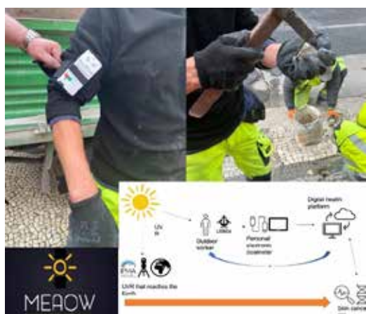
Outdoor workers with UV dosimeters in Lisbon, project logo and graphical description

The Project includes the first phase of the UV-measurements campaign: 231 OW from Lisbon are currently wearing personal UV-dosimeters until October 2023: 70 gardeners, 70 gravediggers, 70 pavers, 10 sanitation workers, 8 street construction workers, and three sailors. The individual measurements are performed with GENESIS-UV dosimeters, worn on the upper left arm, and designed to be carried on for long periods with no interference with the usual job activity. A dermatological screening for skin lesions will be proposed to the same group of OW. Finally, the data collected will be made available through a web-based digital platform. The final results will be disseminated to the scientific community and interested stakeholders.