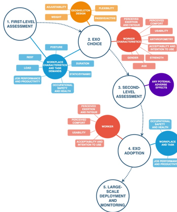
Figure 3: Conceptual framework supporting the introduction of exoskeletons in workplaces.

include the analysis of the whole work system to find the match between the worker anthropometric characteristics, the workplace characteristics and task demands, the exoskeleton features, and, in the case of active exoskeletons, the characteristic of the power feed line and other constraints. Still, the analysis must consider that the effectiveness of occupational exoskeletons is closely related to the anthropometric characteristics of the users. Hence, the promiscuous use of exoskeletons between workers in different work shifts should be avoided.