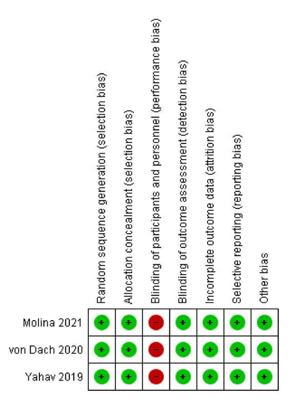
Fig. 2: Risk of bias assessment.

relapse of bacteremia, length of hospital stay, readmission, and local or distant complications, were also demonstrated to be without significant difference. No