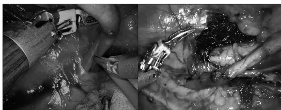
Figure 2. Intraoperative images of the ureter behind the IVC and after the transposition and the ureteroureterostomy.