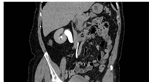
Figure 1. CT scan reconstruction with the image of the S-shaped ureter behind the IVC.

We report a case of a 60-years-old female, who came to our attention for persistent right flank pain and urinary tract infection. The computed tomography (CT) scan revealed right hydronephrosis with dilatation of the upper third of the ureter, up to L4, where it curved posteriorly to the IVC passing to its medial then anterior surface (Fig. 1). The 99mTc mercaptoacetyltriglycine (MAG-3) renal scan showed an obstructed pattern. After obtaining the patient's consent, a robotic correction of the RCU was planned with the Da Vinci Xi. The patient was placed in lateral position. A pneumoperitoneum was created using a Veress needle, and the four robotic ports, spaced ~6 cm apart, were placed in a linear fashion on midclavicular line. Two ports for the assistant were placed at the lateral border of the rectus muscle. After the mobilization of the right colon to expose the retroperitoneal space, the ureter, the gonadic vein, the IVC and the renal pelvis were identified. After the transection of the ureter 3 cm below the