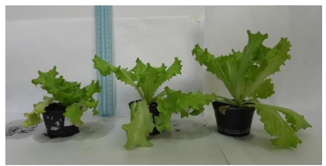
Figure 2. Plants of lettuce at the end of the experiment. From left to right: Control plant (ctrl), plant treated with fermented hydrolysed product (FH) and plant treated with basified fermented hydrolysed product (BFH).