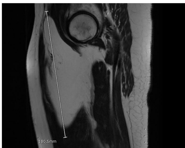
Figure 2. Sagittal section of MRI of lipoma.

pharmacological allergies were reported. Doppler sonography was performed and further investigated with MRI. (Figures 1 and 2).