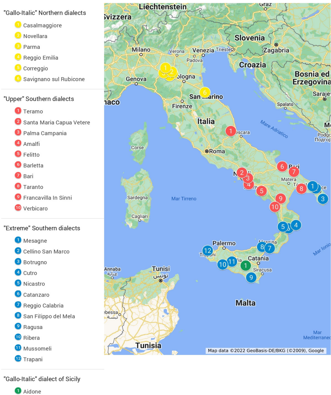
Figure A1. The dialects investigated.