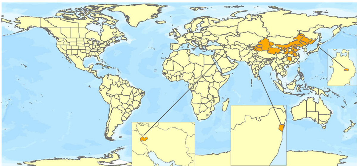
FIGURE 1 Global distribution of Eulecanium giganteum (data source: Deng et al., 2016; García Morales et al., 2016; Kondo & Watson, 2022; Suganthi et al., 2022). The polygons with highlighted orange colour indicate the administrative areas where E. giganteum is present.

E. giganteum is an Asiatic species first described in Morioka, Japan (García Morales et al., 2016). Its present known distribution includes most of northern China, India, Iran, Japan and eastern Russia (Primorsky Krai) (García Morales et al., 2016; Deng et al., 2016; Kondo & Watson, 2022; Suganthi et al., 2022; see Figure 1).