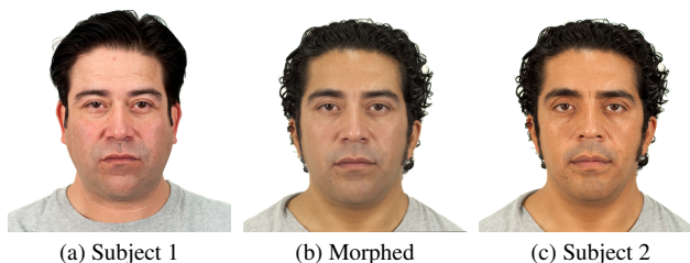
Figure 1. Example of a morphed face (Fig. 1b), a hybrid identity created starting from two subjects (Fig. 1a and 1c). Literature studies [50, 53] have revealed that morphed images can bypass face-based security controls.

Face Morphing, i.e. the technique to merge in a single face two different identities (see Fig. 1), has emerged as a serious threat to Face Recognition systems (FRS) [18]. Indeed, it has been proven [50, 53] that a morphed face can bypass face verification-based security controls, thus enabling a criminal to use the same legal document belonging to an accomplice to fool commercial FRSs located, for instance, in Automated Border Control (ABC) gates. Therefore, accurate and robust Morphing Attack Detection (MAD) [43] solutions are strongly needed to detect the