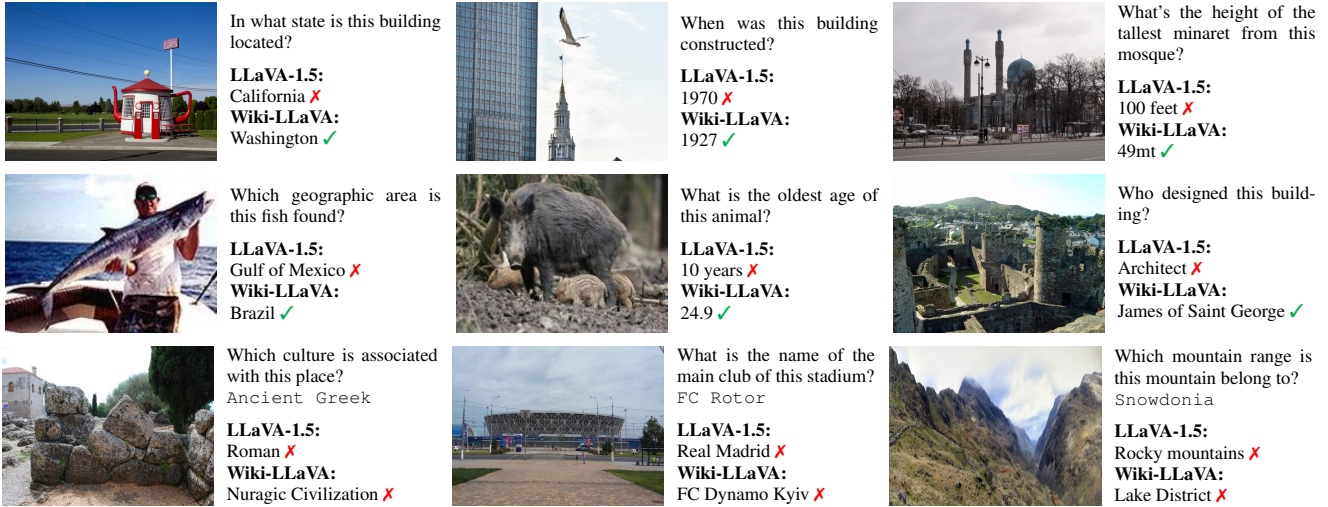
Figure 3. Qualitative results on sample image-question pairs from Encyclopedic-VQA (first row) and InfoSeek (second row) comparing the proposed approach with the original LLaVA-1.5 model. Some failure cases are shown in the third row with the corresponding ground-truth.