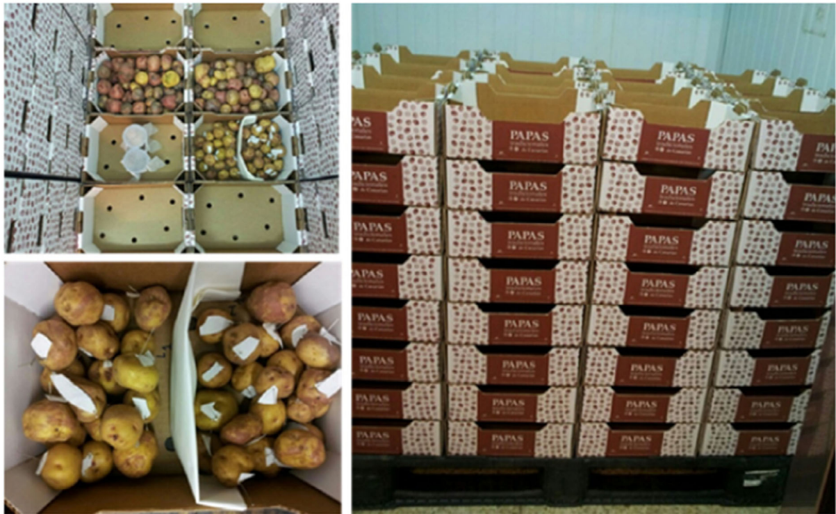
Figure 1: Semi-commercial trial (Lobo et al., 2021).

The Panel decided to evaluate the experimental setup (Sections 2.5 and 2.6 of Lobo et al., 2021) and results (presented in Tables 4 and 5 of Lobo et al., 2021) of the post-harvest treatment in the (semi)-commercial trials.